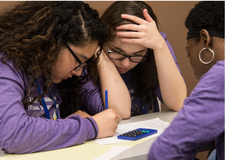
A.R. Johnson High School students put their heads together to puzzle out the answers to Brain Teaser questions.