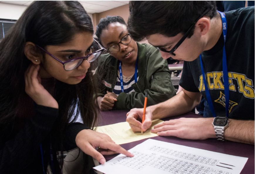
Students from North Augusta High School were among the 24 teams at this year's Science Bowl.