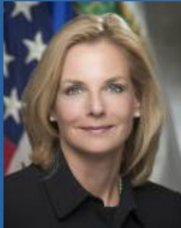
Lisa E. Gordon-Hagerty

Two weeks after being sworn in as DOE's Under Secretary for Nuclear Security and Administrator of the National Nuclear Security Administration (NNSA), Lisa E. Gordon-Hagerty traveled to South Carolina to visit SRS, making it the first field site she visited since being named to the post.