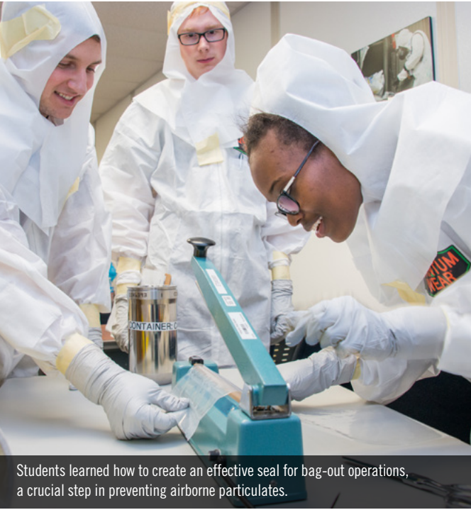
Students learned how to create an effective seal for bag-out operations, a crucial step in preventing airborne particulates.