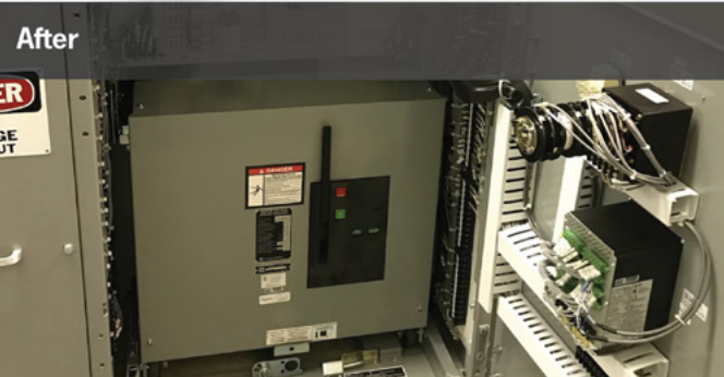
“Before and after” pictures of the K and L areas power distribution system project