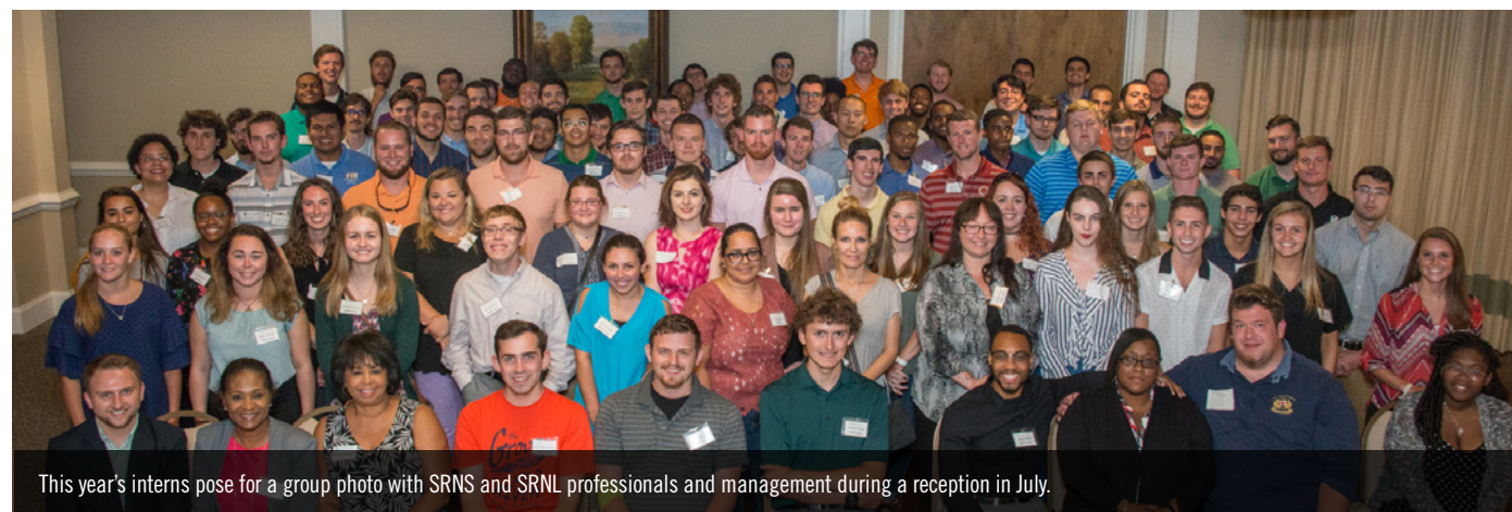
This year’s interns pose for a group photo with SRNS and SRNL professionals and management during a reception in July.

According to Diakun, the acceptance rate of current and former interns offered positions as full service SRNS employees increased from 83 percent in 2016 to 90 percent in 2017.