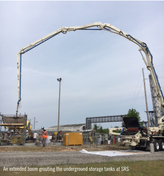
An extended boom grouting the underground storage tanks at SRS

“Being able to treat both areas as one project helped us save costs and time. It’s been a great show of teamwork from all involved,” Spieker said.