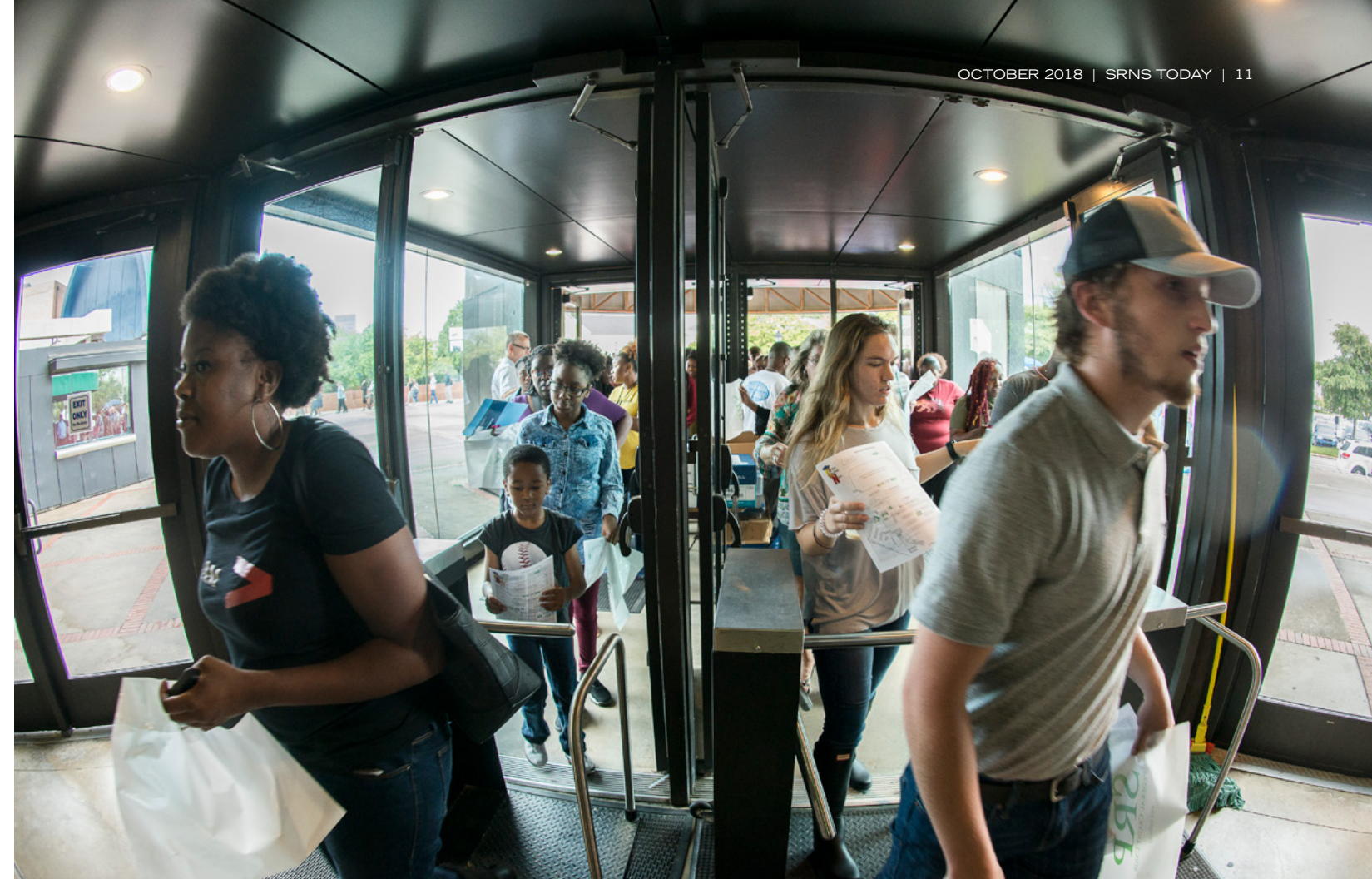
College Night participants pour through the doors of the James Brown Arena in Augusta, Ga.

SRTE plans to hire another class of six operators, and numerous other new employees in the coming months.