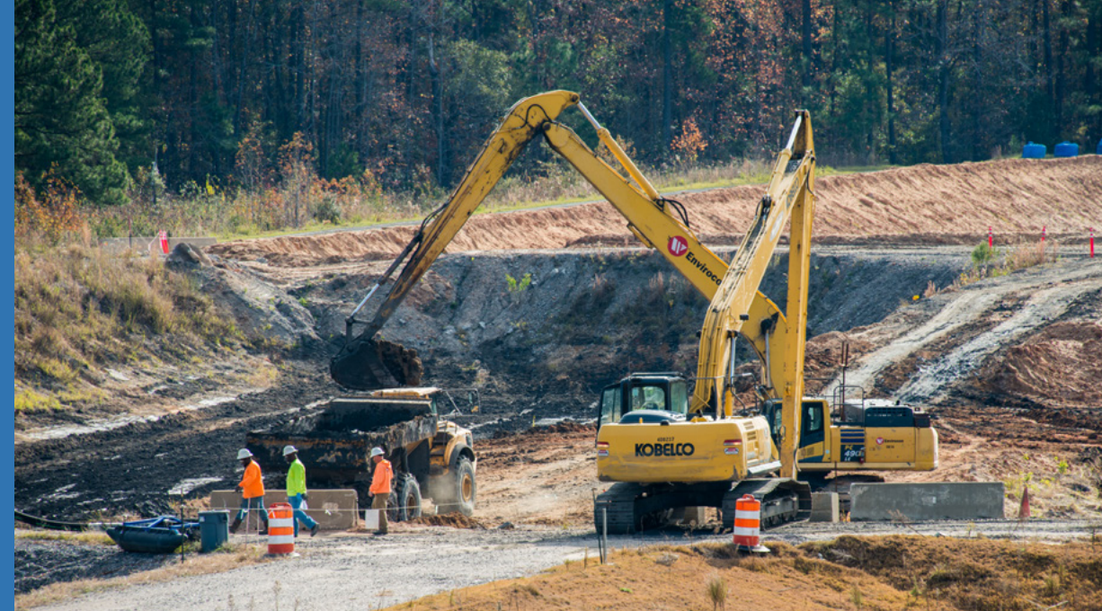
The work on Phase II was completed 14 months ahead of schedule.

The PMI is a not-for-profit membership association that strives to advance the project management profession through global advocacy, collaboration, education and research.