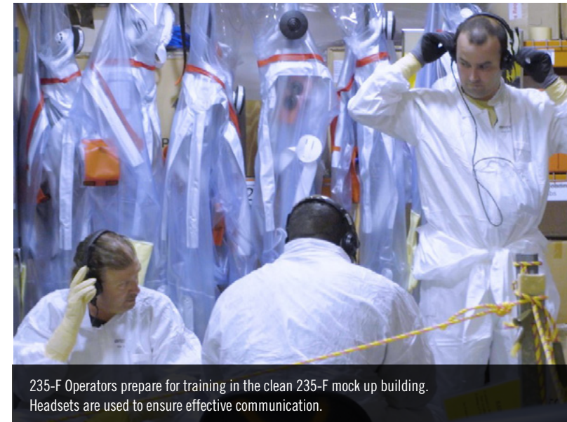
235-F Operators prepare for training in the clean 235-F mock up building. Headsets are used to ensure effective communication.