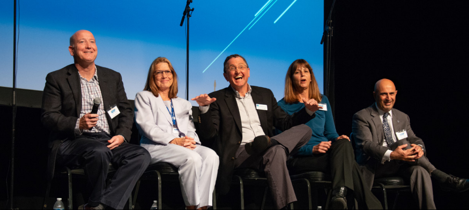
A panel of SRNS senior executives entertain questions during the Aspiring Mid-Career Professionals' RECHARGE event on Oct. 18, at the University of South Carolina Aiken's Etheredge Center. The event included networking opportunities, presentations by several SRS and community leaders, and a vendor fair. AMP is an organization sponsored by SRNS that provides a foundation of leadership principles to help employees be a leader worth following well as provide an environment of support through professional development and community outreach events. AMP serves SRNS full-time employees who have between seven and 20 years of work experience.