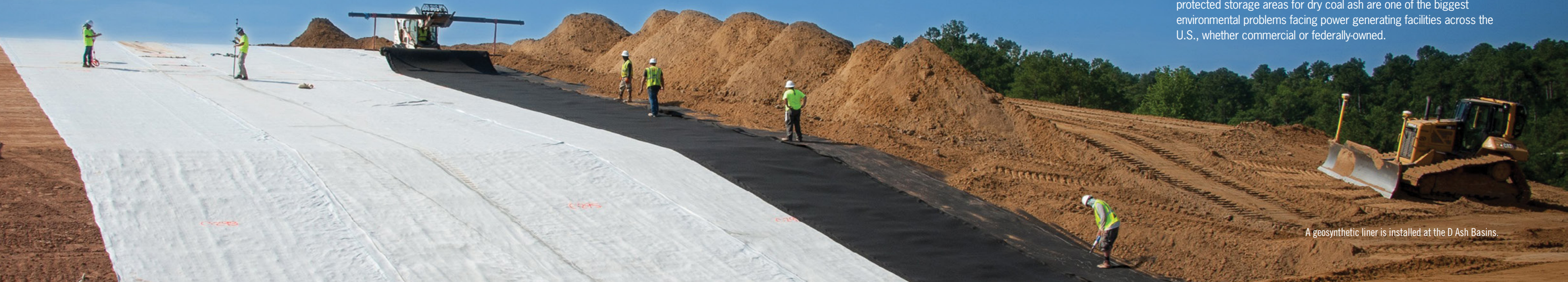
A geosynthetic liner is installed at the D Ash Basins.

According to Adams, the challenges involving the safe conversion of these large holding basins containing wet coal ash into highly protected storage areas for dry coal ash are one of the biggest environmental problems facing power generating facilities across the U.S., whether commercial or federally-owned.