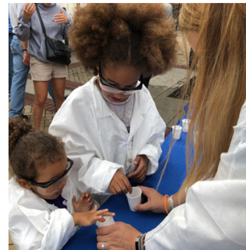
Students wore the proper personal equipment including a lab coat and safety eyewear for their experiments to make snow.

Atoms in the Alley is a free, family-friendly event that promotes science and raises awareness of the Savannah River Site Museum. It is part of Nuclear Science Week, which is a week-long celebration to focus on local, regional, national and international interest on all aspects of nuclear science. Nuclear Science Week takes places internationally each year on the third week in October.